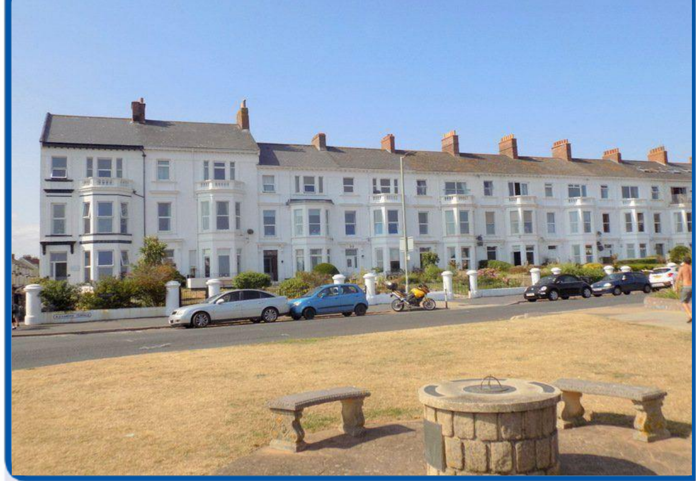
Well Presented Upper Floor Flat Ideally Located Just Off Exmouth Seafront And Close To The Town Centre

Flat To Rear OF Period Building * Modern Gas Central Heating System Modern Upvc Double Glazed Windows * Lounge * Separate Kitchen * Double Bedroom * Bathroom/Wc * Super Permanent Or Holiday Home Retreat